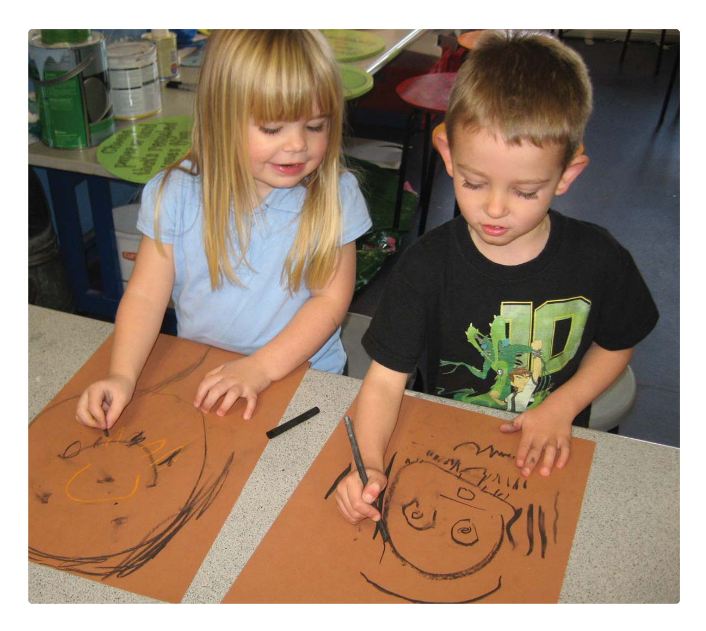
Hafod Primary School children studying sculpture and producing charcoal drawings

demonstrate their full support. We will ask them to nominate a member of staff, preferably a head of department or member of the senior management team to play the role of School Creativity and Arts Champion. This person will be the link between their school and the opportunities available through the regional network. They will help their school to identify their arts education priorities, ensure that their school is aware of best practice and can make the most of the benefits of greater access to arts and creative opportunities.